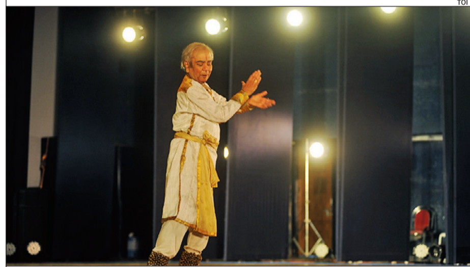
Kathak exponent Pandit Birju Maharaj performed on the last day of Suvarna Parva, three-day Kathak extravaganza, at Tagore Hall on Sunday. The event marks 50 years of city-based Kadamb Centre for Dance and Music.