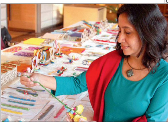
Sarkhej Roza Women Crafts Committee launched its line of products made by local women and launched its website at a city hotel on Sunday in Ahmedabad. The projects, primarily made of crochet work, would provide livelihood to the local women, said organizers.