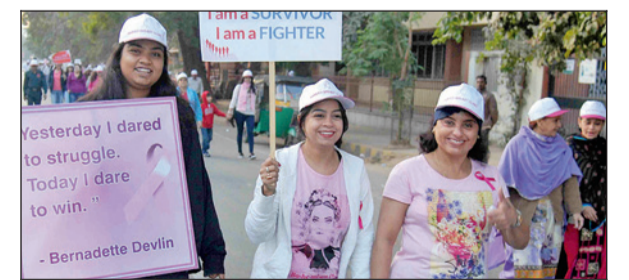
Breast cancer awareness rally held in Ahmedabad on Sunday