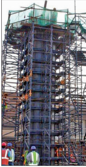
area for constructing a casting yard and a depot.