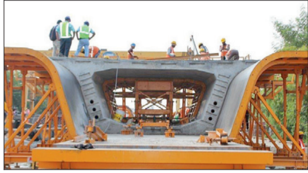
The Metro corridor podium being cast at Apparel park in Vastrapur

Ahmedabad: It was in 2012 that MetroLink Express for Gandhinagar and Ahmedabad (MEGA) had proposed a 76-km long and Rs 20,000 crore worth of metro rail project for Ahmedabad and Gandhinagar just before the assembly elections that year. A few months later, the project met a dead end when the executive chairman of MEGA, Sanjay Gupta, had to step down following allegations of Rs 300 crore worth of irregularities. Clearly, it was a big blow for the state government and the metro dreams of the cities. By September 2013, when the state government had appointed a new vice-chairman and chairman for MEGA, the governing body had bloated to around 250-odd staff. It took the new board al-